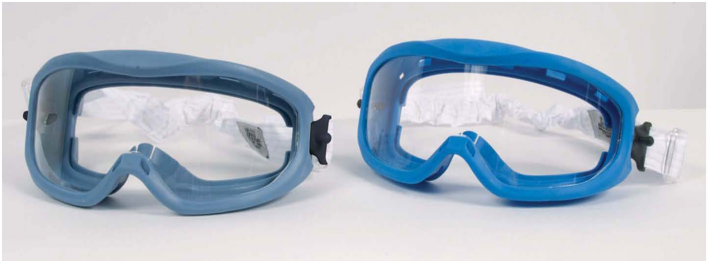
L-R goggles after 20 cycles of gamma irradiation and pre-irradiation

The goggle is ANSI Z87 compliant and is validated and generally appropriate for use in both aseptic and non-aseptic environments. Your employees are protected from the risk of work-related accidents.